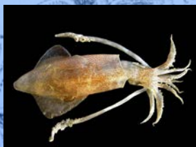
Squid: http://en.wikipedia.org/wiki/File:Loligo_vulgaris.jpg ; Octopus: http://en.wikipedia.org/wiki/Common_octopus

There is evidence for increased neural and behavioural complexity, growth rate and learning performance in animals given an enriched environment. Papers on environmental enrichment are beginning to emerge. There is a great need for more research in this area.